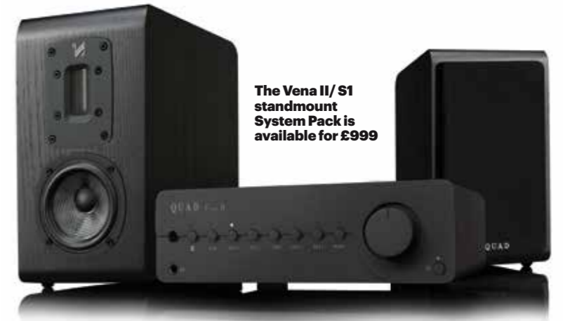
The Vena II/S1 standmount System Pack is available for £999

HOW IT COMPARES An obvious rival for the Vena II is NAD's unique-looking D 3020 V2, at £399 ( HFC 435). Like the Quad, it now has a moving-magnet phono stage input. Marantz has taken its classic amplifier style and minimised it to create the £750 HD-AMP1, complete with 'computer audio' input and extended DSD capability. If you want to go truly tiny, Pro-Ject's minute MaiA S2 is just over 200mm wide and stands 36mm tall, yet claims to deliver sufficient power – 25W per channel – to feed sensitive standmount speakers.